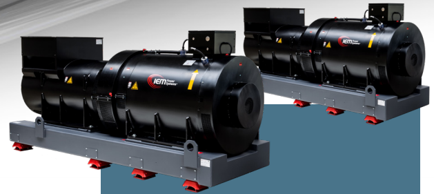
RBT-2000D-50 2000 kVA / 1600 kW